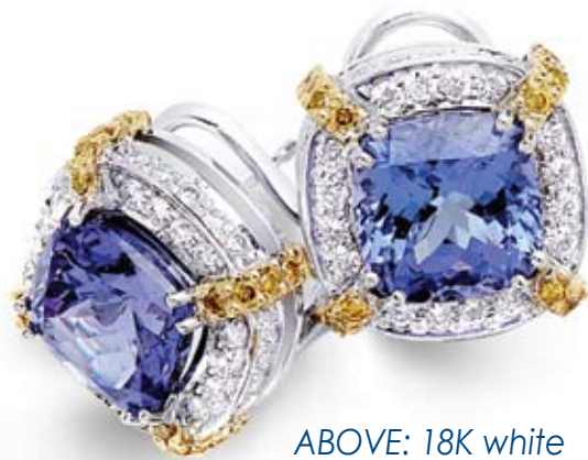
ABOVE: 18K white gold earrings with natural white and yellow pavé-set round diamonds. Stunning sapphires are the focal point of this pair of earrings.