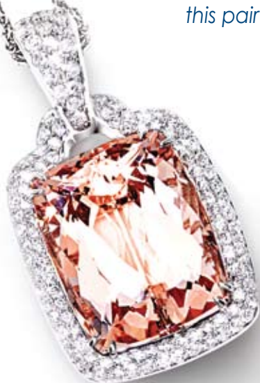
LEFT: 18K white gold pendant with pavé-set round white diamonds. The center stone is a magnificent Imperial Topaz.

Big diamonds? They are certainly beautiful. But what about big precious and semi-precious colored stones? We are proud that Roman Jewelers is equally established in bringing to you one-of-a-kind precious gemstones of all sizes, in diamonds or colored stones. We believe that high fashion calls for big statements, and going big is one of the best ways to do that. Cushion cut stones are fabulous for BIG rings that can be accented with precision set diamonds to create a mix of color, shine, and fire. Long pear shape stones and delicate diamonds create a graceful look that elongates a finger or a neck.