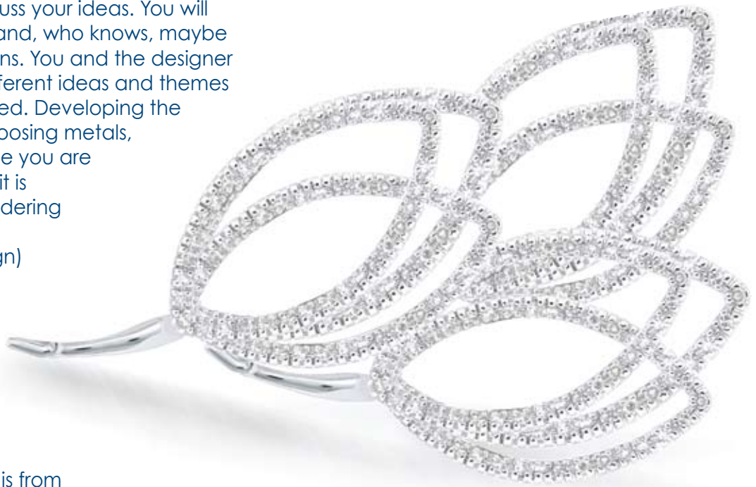
ABOVE: Custom designed diamond Tulip brooch.

With the idea of creating something special for Mothers Day, a family came into Roman Jewelers, with one intent: to make a very special piece of jewelry for their Mom. After discussing her interests, they had an "aha" moment and realized that their mother devoted almost as much time to her tulip garden as she did to care for her children, and treated the garden like an extended family. That was all they needed to start having ideas and sketches flow for the most appropriate gift. For this contemporary, fashion forward mother we created a sketch of a tulip brooch with sleek lines and sweeping curves. When finished, the piece was something the whole family was a part of creating and their mother loved the present, too.