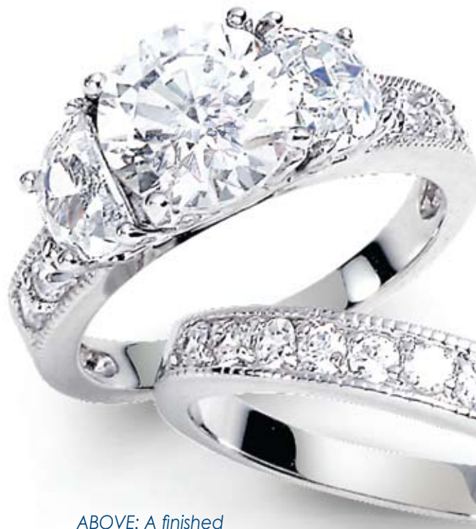
ABOVE: A finished 3-stone engagement ring and eternity wedding band