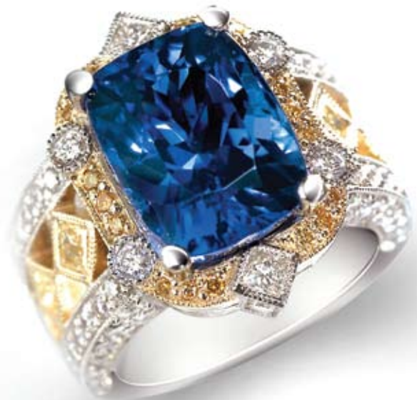
ABOVE: Custom designed tanzanite ring, with white and yellow diamonds

Quite often, we use multiple stones from tennis bracelets to create truly magnificent "wow!" pieces.