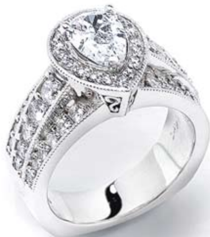
LEFT: Engagement ring with a large pear-shape diamond set as a center stone.