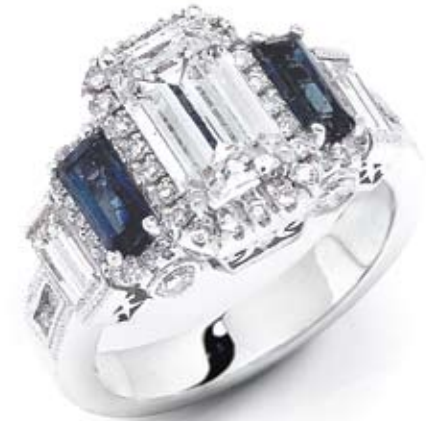
ABOVE: Engagement ring with a large emerald cut diamond set as a center stone, accented by round and baguette diamonds and two sapphires.

Don't ever limit yourself to what is "in stock". A good jeweler can acquire stones of any shape, color, size, and quality. With a close relationship to the largest diamond providers in the world, Roman Jewelers is able to bring you a selection of truly amazing diamonds.